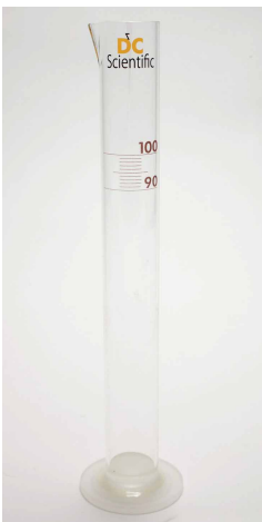
All Glass D86 RECEIVER