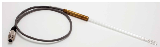
PT-100 Temperature Probes