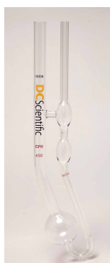
Viscometer Tube D445/6