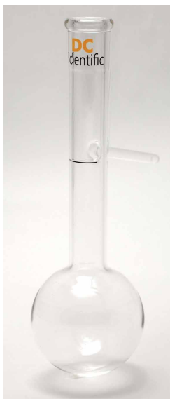
Standard D86 FLASK

DC manufactures ALL types and provides excellent delivery times.