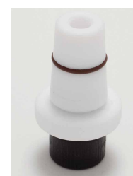
PT-100 Centering Device