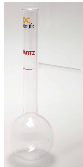
QUARTZ D86 FLASK