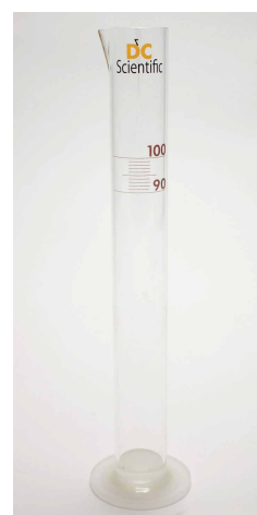
All Glass D86 RECEIVER