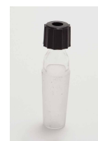
PT-100 Head Adapter